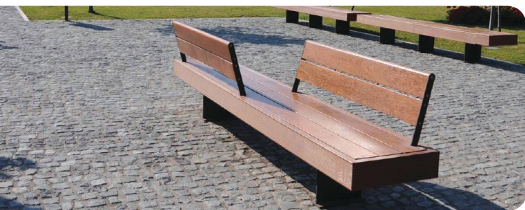
Image showing split backrest.